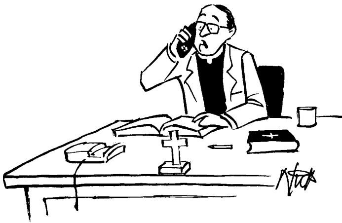
"Er, I don't think there is a patron saint of the internet ..."