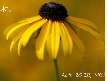
Acts 20:28, NRS

Keep watch over yourselves and over all the flock.